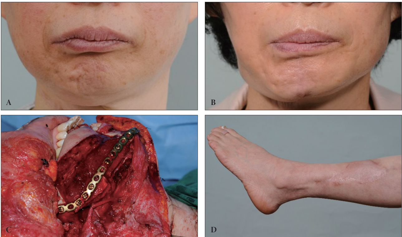
Fig. 1. Case 1. A 55-year-old woman had a mandibular reconstruction using an osteocutaneous fibular free flap. The donor wound had dehiscence and was treated with negative pressure therapy, and the wound was completely healed with the use of a skin graft. (A) Preoperative photograph. (B) Photograph at 2 years after surgery. (C) Intraoperative photograph. (D) Donor site scar at 2 years after surgery.