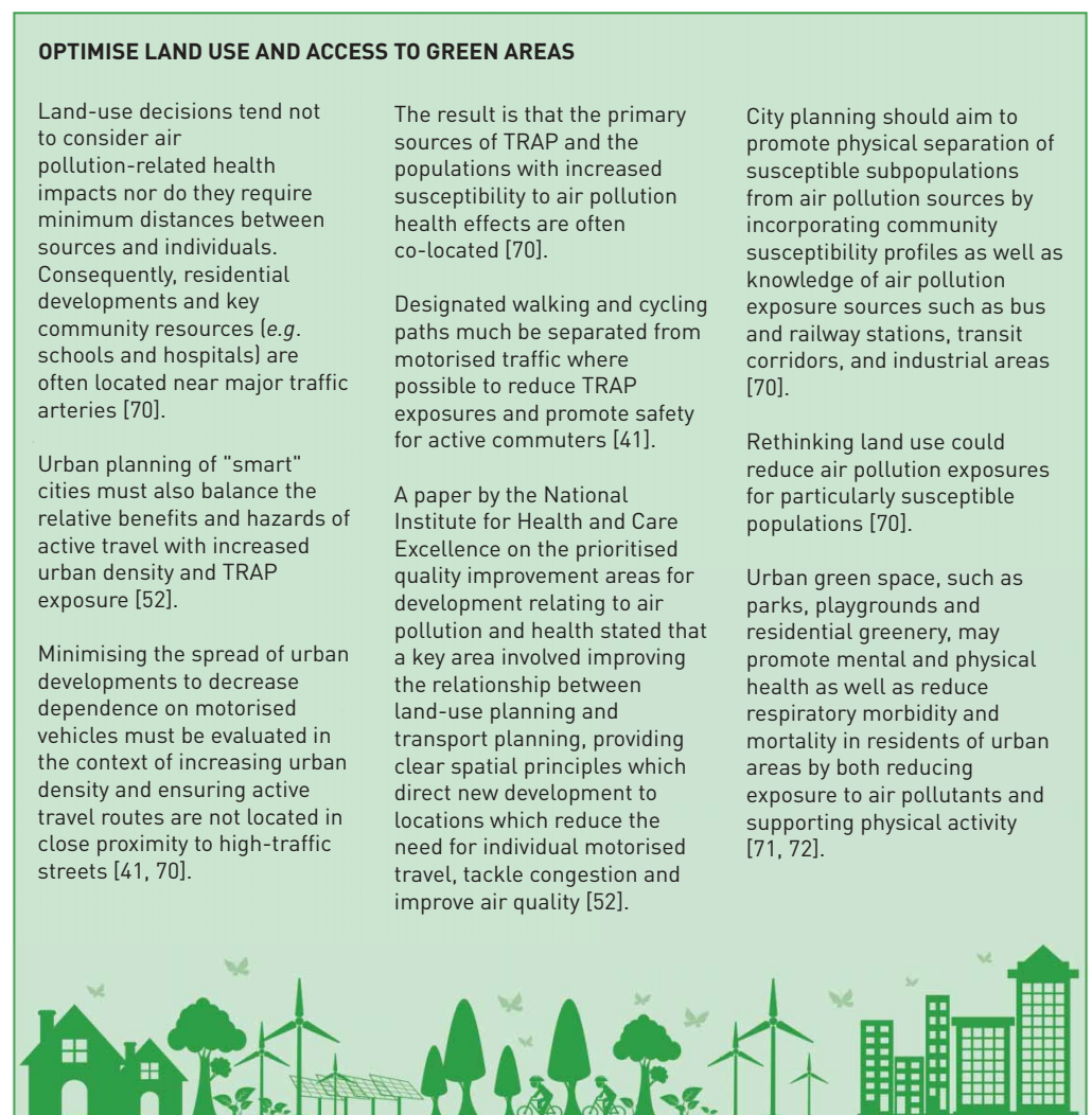
FIGURE 2 Community-level interventions. TRAP: traffic-related air pollution.

Children are, by their shorter stature, closer to the source of air pollution and have a faster respiratory rate which results in their exposure to black carbon being disproportionately high, particularly in association with transit to and from school, and at school [74]. Children's exposure can be reduced by avoiding major intersections, busy roads and queuing traffic where possible, and walking on the least trafficked side of the road [58]. Walking on the downhill side of the road (relative to traffic flow) may also help since driving uphill induces engine load, which increases emissions [75].