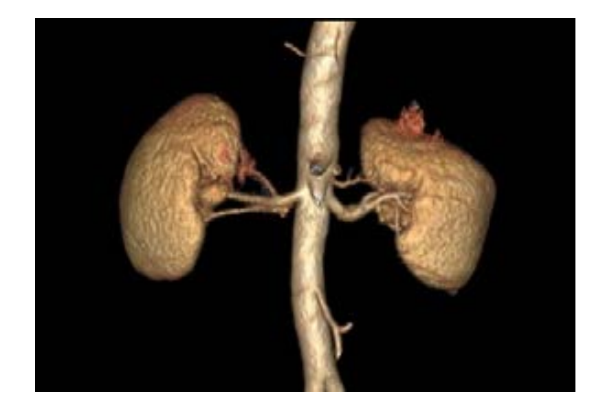
Figure 3: Bilateral accessory renal arteries