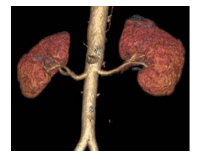
Figure 1: Showing single renal artery on both sides

, 32 (32%%) had either unilateral or bilateral accessory renal arteries while 18 (18%) had unilateral or bilateral early divisions of the renal artery. An accessory renal artery was found on the right side in 10 patients (20%) and left side in 12 cases(24%) respectively (Figure 2).