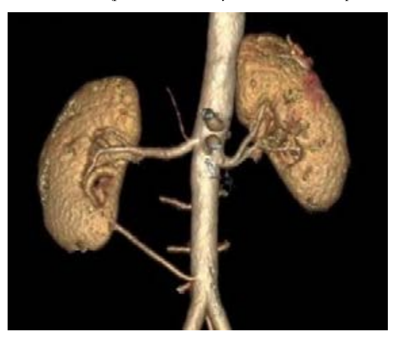
Figure 5: Co-existence of accessory right renal artery and left early division of renal artery

There was a co-existence of early division and accessory renal arteries in 2 patients (Figure 5).