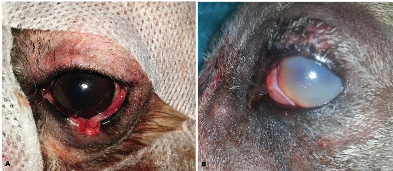
Fig. 2. Images of the eyes of (A) an 18-month-old male Griffon and a (B) 2-year-old mixed breed dog after successful globe replacement surgery. (B) Note the persistence of corneal edema associated with the eye of the mixed breed dog.

OS, optic sinister; OD, optic dexter; DR, dorsal rectus; VR, ventral rectus; MR, medial rectus.