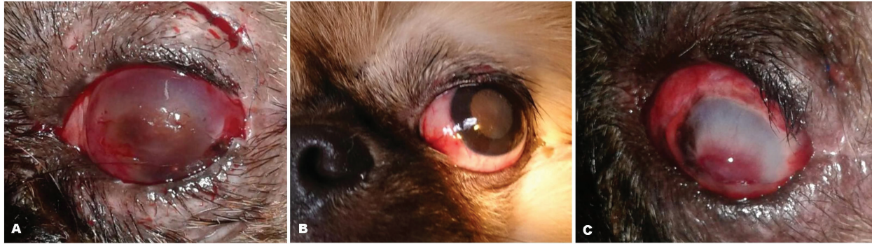
Fig. 3. Images of the eyes of three Pekingese dogs after successful globe replacement surgery and removal of the tarsorrhaphy sutures illustrating (A) keratitis with possible corneal pigmentation; (B) dilated pupil and lateral exotropia; and (C) early signs of atrophied globe with corneal fibrosis, central granulation tissue, and minimal lateral exotropia.