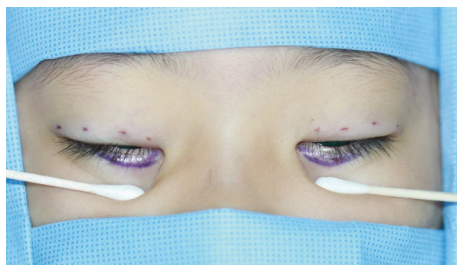
FIGURE 2: The photography showing the marking of the upper lid sutures placement and the lower lid incision.

the lower lids of 629 patients (80.3%), and on the upper lids of 72 patients (9.2%, Table 1). The mean postoperative follow-up period was 13.40 \pm 7.58 months. Eyelid shape and function were maintained in 740 patients (96.4%) with no epiblepharon recurrence at the final follow-up examination.