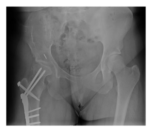
Fig. 2. AP Pelvis, post-operative.

radiologic results since other imaging parameters of the proximal femur were difficult to deduce due to hardware interference. The pre- and post-operative NSA was 120 and 138.7, respectively, indicating correction of coxa vara. Also, the offset increased post-operatively when measured radiographically and the femoral head-neck convexity also improved. Figure 2 illustrates the radiological characteristics after surgery.