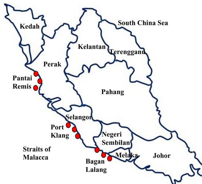
Fig 1. Location of marine fish sampling sites.

The primary fish landing areas of the west coast of Peninsular Malaysia, facing out to the Straits of Malacca, partitioned into three regions: the northern region (Perlis, Kedah, Penang and Perak), the central region (Selangor, Kuala Lumpur and Putrajaya) and the southern region (Negeri Sembilan, Malacca and Johor) were chosen as the sampling locations. Over the period November 2011 to February 2012, the samples were collected from coastal locations of Pantai Remis (4.4500° N, 100.6333° E) in Perak, Port Klang (3.0000° N, 101.4000° E) in Selangor, and Bagan Lalang (5.4333° N, 100.3833° E) in Negeri Sembilan, all surrounded by many fishing villages (Fig 1). In each case, there are nearby large-scale industrial activities, and