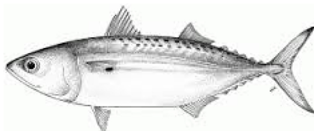
Fig 2. Kembung fish ( Rastrelliger kanagurta ).

The samples were of two categories: fish and seawater. The fish, a particular species of Mackerel (local and scientific name, Ikan kembung and Rastrelliger kanagurta (Phylum: Chordata; Family: Scombridae; Genus: Rastrelliger ; Species: R. kanagurta ) respectively)) were collected from coastal fishing jetties at various locations (Fig 1 and Table 1). The sampling informations are shown in Table 1. Same size and amount (125–130 g each) of fish samples (Fig 2) were collected and washed, cut into smaller pieces and dried in a furnace at 70°C over a period of three days. The samples were then pulverized to obtain a fine powder and sieved for homogeneity. Sea water samples were collected from an approximate depth of one meter from the surface