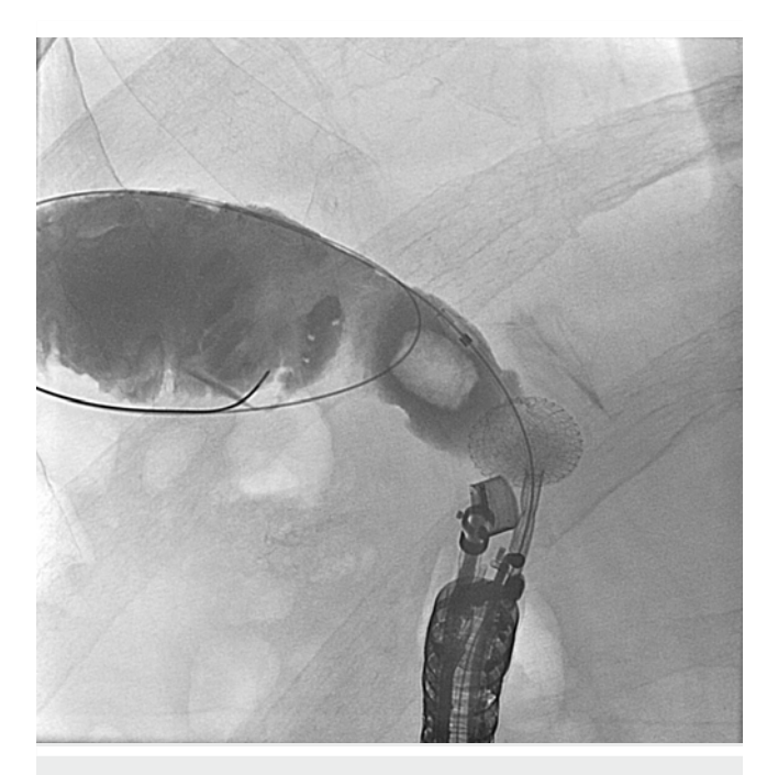
Fig.2 Guidewire passed into gallbladder in order to secure position and aid stent placement.