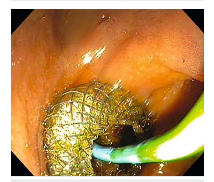
▶ Fig. 3 Endoscopic view of duodenum following cholecystoduodenostomy with lumen apposing metal stent and plastic pigtail stent placement within.

directly into the gallbladder without a guidewire. In all technically successful cases performed by one endoscopist (THB) a 7Fr double pigtail plastic stent was placed within the LAMS over a guidewire.