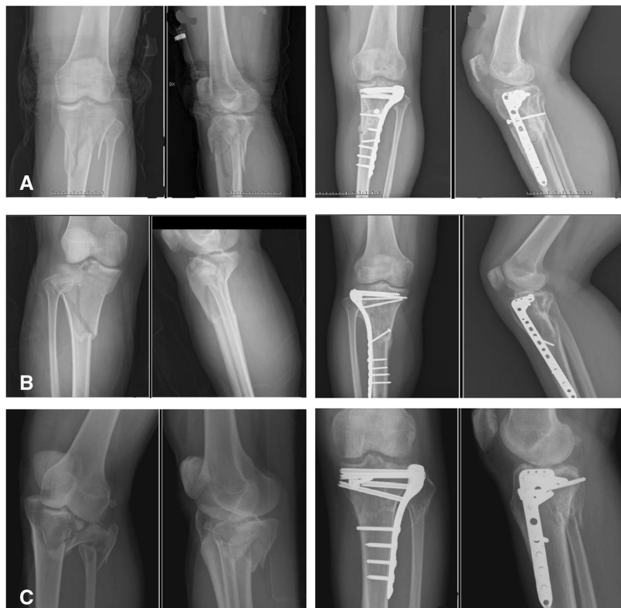
Figure 2 Illustrative cases of group I, treated with unilateral locking plate (ULP). (A) A 39-year-old female sustained a left knee tibial plateau fracture (TPF), Schatzker classification type VI, and she was subsequently treated with a unilateral locking plate as shown. (B) An 18-year-old female sustained right knee Schatzker type VI TPF after being in a motor vehicle accident. She subsequently received ORIF with ULP. (C) A 51-year-old male sustained left knee Schatzker type V TPF with dislocation after being in a crash accident. He then received ORIF with ULP.

The goals of operative treatment for TPFs were anatomic reduction, especially in restoration of articular congruity, stable fixation for early rehabilitation, and avoidance of complications, particularly infection and non-union. In our study, we included a series of 45 bicondylar TPFs, Schatzker type V or VI, which were all followed up for at least 18 months. We found a significantly different ratio of Schatzker type V/VI between group II (CDP) and group III (HDP); this may be because the fracture pattern of Schatzker type VI is bicondylar metaphyseal involvement with diaphyseal extension, and the pre-contour periarticular locking compression plate offers more advantages than classic buttress plates for fixation via the minimally invasive plate osteosynthesis (MIPO) technique. Turning to the surgical procedure,