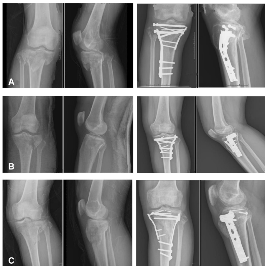
Figure 3 Illustrative cases of group II, treated with classic dual plates (CDP). (A) A 49-year-old man sustained right knee TPF, Schatzker classification type V, after being in a motor vehicle crash. ORIF with CDP was demonstrated. (B) A 47-year-old woman sustained left knee Schatzker type V TPF after being in a falling accident. She subsequently received ORIF with CDP. (C) A 60-year-old man sustained left knee Schatzker type VI TPF. He received ORIF with CDP thereafter.

we applied the single pre-contour periarticular locking plate over the lateral compartment via the MIPO technique in group I, thus avoiding medial periosteal stripping [11,12]. This method reduced the operation time effectively, and patients sustained less discomfort resulting from surgical manipulation of an already injured soft tissue envelope. Furthermore, a shorter hospitalization period and lower cost were also noted in this group. Kenneth et al. [13] reported 38 patients with complex tibial plateau fracture treated with LISS plating system and concluded that it provides stable fixation of complex bicondylar TPFs allowing early range of knee motion with favorable clinical results.