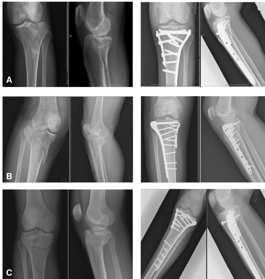
Figure 4 Illustrative cases of group III, treated with hybrid dual plates (HDP). (A) A 76-year-old man suffered from left knee TPF, Schatzker classification type VI, after a slithering accident, and he subsequently received ORIF with HDP. (B) A 43-year-old woman sustained right knee Schatzker type V TPF after being in a motor vehicle crash. She received ORIF with HDP thereafter. (C) A 19-year-old man suffered from right knee Schatzker type VI TPF in a car crash. ORIF with HDP was demonstrated.

stabilization of comminuted bicondylar TPFs through medial and lateral surgical approaches is a useful treatment method to achieve well functional outcome though some cases still have residual dysfunction.