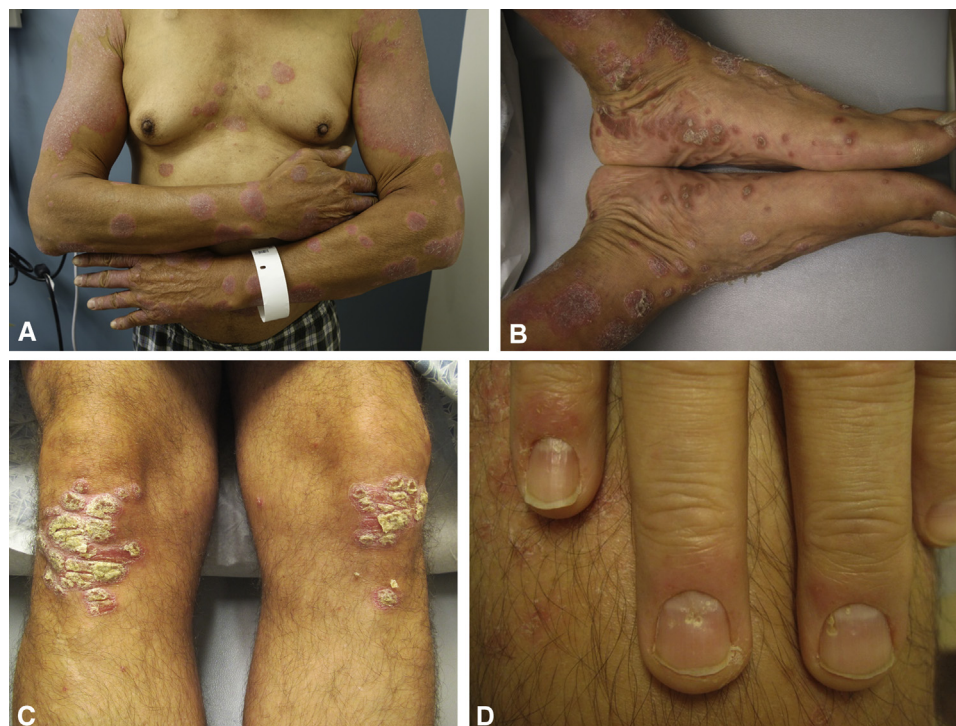
Fig 1. Clinical photographs of patients 1 and 2. A , Patient 1. Diffuse, discrete, annular, thin pink plaques with adherent scale on the trunk and extremities. B , Patient 1. Pink-to-orange hyperkeratotic papules and plaques with adherent scale on the bilateral ankles and plantar feet. C , Patient 2. Psoriasiform pink plaques of the bilateral lower extremities with overlying adherent, micaceous scale. D , Patient 2. Scattered fingernail pits.