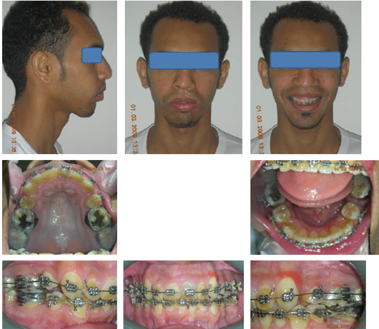
FIGURE 3: Postsurgical extraoral and intraoral photographs.

incisors were decompensated, and a space left in the upper premolars area for anterior maxillary was set back.