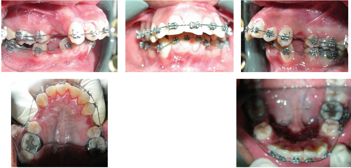
FIGURE 2: Presurgical intraoral photographs.