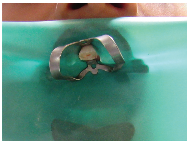
Figure 1: Clinical photograph depicting tooth isolated using rubber dam after administration of local anesthesia.