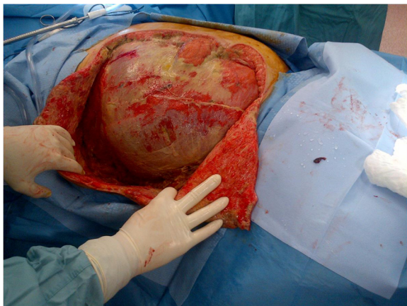
Figure 2 Intact transversus abdominus layer following resection of the external and internal oblique aponeuroses, rectus muscles, and a portion of the pectoralis muscle.

Immediate antimicrobial support and operative intervention led to resection of the entire external oblique and transversus abdominus aponeuroses, rectus muscles, and a portion of the pectoralis muscle of the patient's right torso (Figure 2). The tissues displayed the classic brown dishwater appearance. The internal oblique aponeurosis and two large triangular skin flaps were left intact (Figure 3). It should be noted that the small laparotomy incision was re-opened to ensure the absence of a missed bowel injury or intraperitoneal source of the contamination. A negative pressure dressing was then applied superficial to the internal oblique layer, followed by loose approximation of the large skin flaps. The patient was returned to the operating room eight hours later because minor additional debridements, washout,