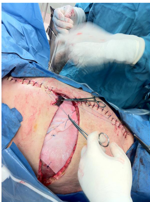
Figure 5 Closure of skin flaps over the abdominal wall reconstruction.

Although up to 80% of necrotizing soft tissue infections are polymicrobial, Clostridium species are still associated with the classic presentation of gas gangrene myonecrosis [3]. Typically the presence of soft tissue gas, as observed in this patient, offers a grave prognosis [4]. In addition, gas gangrene of the torso carries an even worse outcome given the typical requirement for radical full thickness debridement that often results in open abdominal and thoracic cavities with exposed viscera [2]. Because of the tremendous risks associated with soft tissue coverage and eventual reconstruction, our patient underwent an alternative strategy. By maintaining two large, well-vascularized subcutaneous flaps as potential coverage, in addition to the internal oblique aponeurosis as a barrier to the peritoneal cavity, we were able to maintain significant reconstructive options. Given the risk inherent in this initial approach,