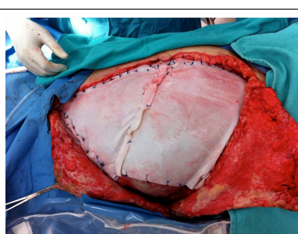
Figure 4 Reconstruction of the abdominal wall with 2 large pieces of biologic graft.

The final closure utilized two large pieces of biologic material (Strattice™, LifeCell Inc., New Jersey, USA) to prevent subsequent hernia formation (Figure 4). This repair was particularly important inferior to the arcuate line, given that only the posterior rectus sheath remained intact throughout his hemi-torso. The biologic material was sewn to the linea alba (medial), costal rib margin (superior), right flank (lateral), pubic bone and the inguinal ligament (inferior). This provided an excellent reconstitution of the patient's abdominal wall. The two large skin and