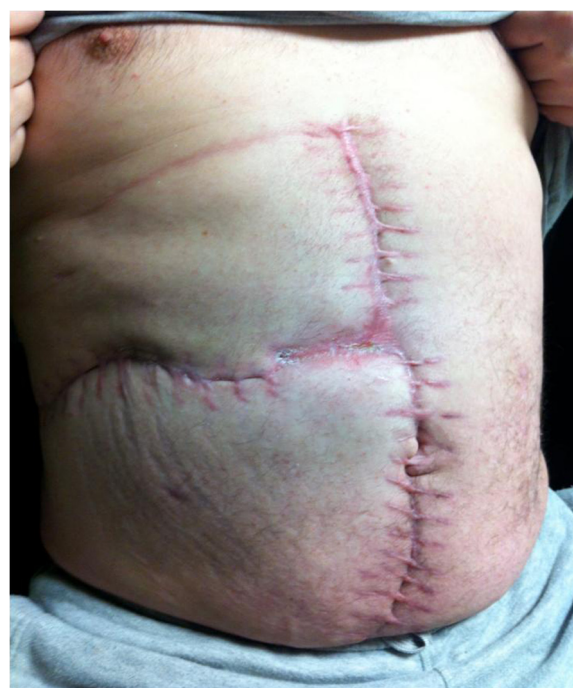
Figure 6 Abdominal wall 12 months after the reconstruction.

the patient was returned to the operating room for a second tissue evaluation only eight hours after the initial debridement. As a consequence of his radical improvement in physiology and tissue quality, we persisted with this methodology.