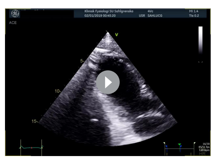
Video 1 Ultrasound images approximately 1 day after admission. The apical three-chamber view shows a substantially reduced ejection fraction and abnormal movement of the left ventricle wall characteristic of takotsubo cardiomyopathy.

Endocrinologists are repeatedly consulted and as the initial tests are inconclusive of adrenal insufficiency and the primary response to high-dose hydrocortisone scarce the diagnosis halters for a while. After re-examination of morning values of serum cortisol (80 nmol/L) and plasma adrenocorticotropic