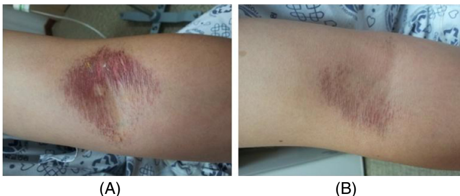
Figure 3 Skin lesions of antecubital fossa of both arms. (A) Left antecubital fossa. (B) Right antecubital fossa.

Based on the patient's medical test results, MetHb level, and exposure history to aniline, the patient was diagnosed with methemoglobinemia. He was given O 2 inhalation treatment (10 L/min via a mask) and 7 ml of 2% methylene blue diluted in 100 ml of saline solution. His MetHb was 25.3%, 19.3%, 9.9%, and 6.6% at one, two, four, and six hours, respectively after the treatment. According to an arterial blood gas examination on the second day of his hospitalization, his pH was 7.34, PCO 2 was 47.2 mmHg, PO 2 was 237 mmHg, HCO 3 - was 25.0 mmol/L, O 2 saturation was 99.0%, and MetHb was 2.4%. The symptoms caused by the methemoglobinemia, such as cyanoderma, gradually improved. An ointment was applied to skin lesions (primary burns and contact dermatitis) caused by aniline. Eye drops were applied for cornea inflammation. According to an arterial blood gas examination on his fourth day of hospitalization, his pH was 7.46. PCO 2 was 34.1 mmHg, PO 2 was 119 mmHg, HCO 3 - was 24.2 mmol/L, O 2 saturation was 97.2%, and MetHb was 0.8% (Table 2). The level of MetHb returned to normal. The symptoms of methemoglobinemia were gradually alleviated, and he was discharged from the hospital at 2 pm on the seventh day of hospitalization.