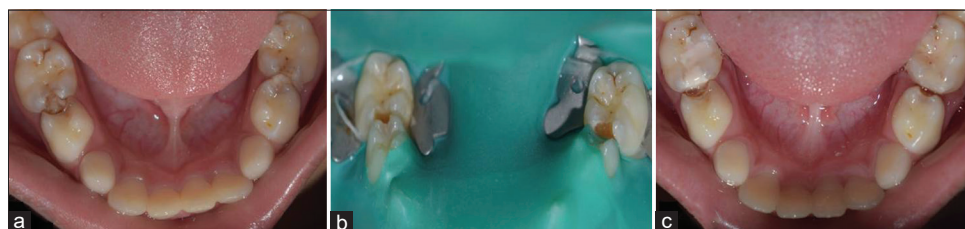
Figure 1: (a) Class II dentinal caries with respect to 75 and 85 (b) Rubber dam isolation done with respect to 75 and 85 (c) Cention N restoration done with respect to 75 and resin-modified glass ionomer cement restoration done with respect to 85

The collected cotton pellet was emulsified in 500 \mu L of PBS solution with a pH between 7.2 and 7.4. 0.01 ml of this solution was taken for bacterial counting using the surface plating method. [12] These plates were incubated at 37°C for 24 h in a carbon dioxide incubator. The number of bacterial colonies was multiplied by the dilution factor and the numbers of colonies were expressed in terms of CFU/ml.