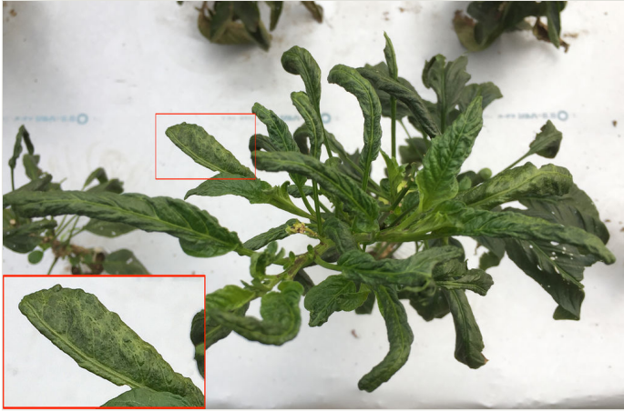
Figure 6. doi

Regarding virus-like diseases in our research fields, pepino leaves showing necrosis were rarely found in the greenhouse (Fig. 5). However, upper leaves showing mottle symptoms with deformation were remarkably observed only in the acaricide-untreated pepinos in the open field (Plot A) during September to October (Fig. 6). Those symptomatic leaves were tested for the detection of Alfalfa mosaic virus (AMV) and Cucumber mosaic virus (CMV), as well as the genera Carlavirus , Potexvirus , and Potyvirus . All tested pepino leaves showed no infection of the above-mentioned viruses (data not shown).