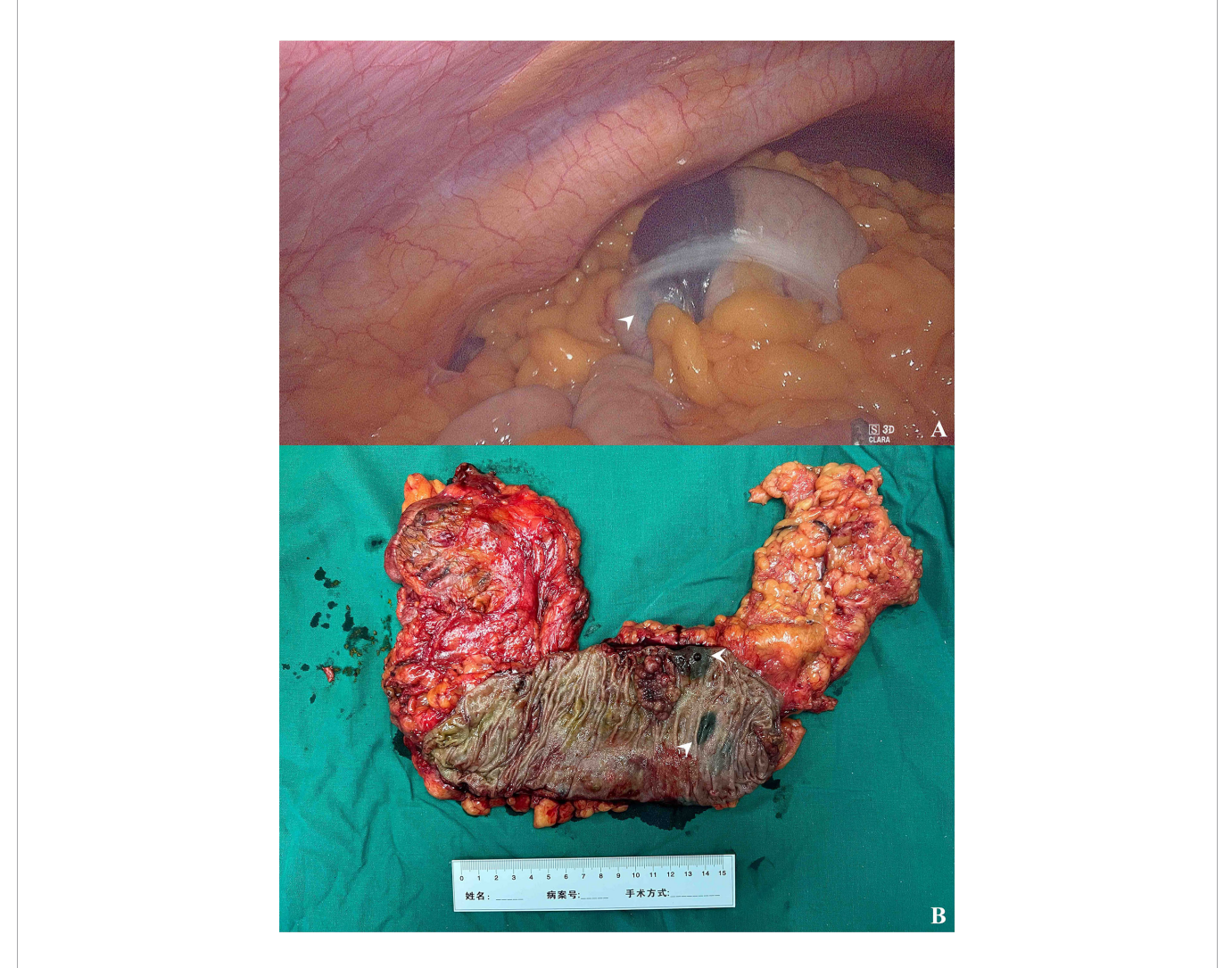
FIGURE 4 | The intraoperative finding of tattooed colon cancer. (A) The black patch in the hepatic flexure under laparoscopy (arrowhead). (B) The resected surgical specimen and two tattoos caudally to the cancer lesion (arrowheads).

It is well known that endoscopic tattooing can cause some unusual complications, such as fat necrosis, adhesion formation, perforation, peritonitis, and even liver abscess (6, 18, 19). In this study, we placed the nanocarbon tattoo in a standardized saline bleb technique to reduce the risk of peritoneal spillage and deep muscular injury (9) with no tattooing-associated complications occurring. The tattoos were mostly injected caudally or just beside the lesions in this study (in total 84 cases, 89.4%), and technically the location of the tattoo would not influence the