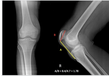
Figure 2: Pre-operative radiograph of the knee showing Insall-Salvati ratio of 1.78.

The patient had bipedal right extensor lag gait. A transverse scar of 1 cm × 8 cm was present inferior to the patella. Depression was noted between the inferior pole of patella and tibial tuberosity. The patient was unable to extend the knee but had active flexion up to 120° (Fig. 1).