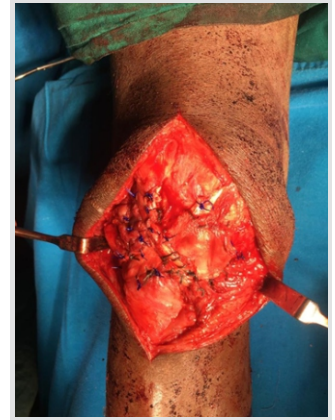
Figure 4: Final configuration of the allograft with the grafts end sutured using non-absorbable sutures.

lateral side of the tibial end (Fig. 4). This gave the final structure a figure of 8 configurations (Fig. 5).