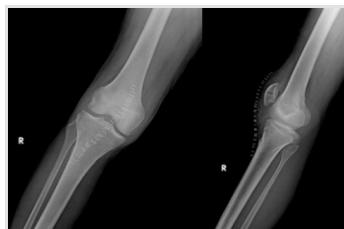
Figure 6: Immediate post-operative radiograph,