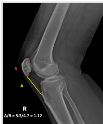
Figure 7: Radiograph taken at 3 years follow-up showing an Insall-Salvati ratio of 1.12.

Tourniquet was avoided as this would have tethered the contracted quadriceps and caused difficulty in achieving patellar height [6]. Cannulated cancellous screws and tensioning device are used to achieve patellar height [8]. We were prepared to use these screws in case the height that would not have been corrected by adequate