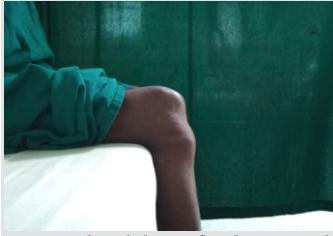
Figure 1: The right knee in flexed position with depression noted between inferior pole of patella and tibial tuberosity.