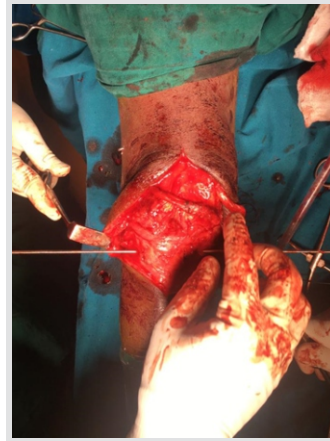
Figure 3: Five millimeters reamer passed through proximal tibia.