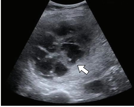
FIGURE 1: Right upper quadrant ultrasound showing a complex hepatic lesion with multiple internal septations (arrow).