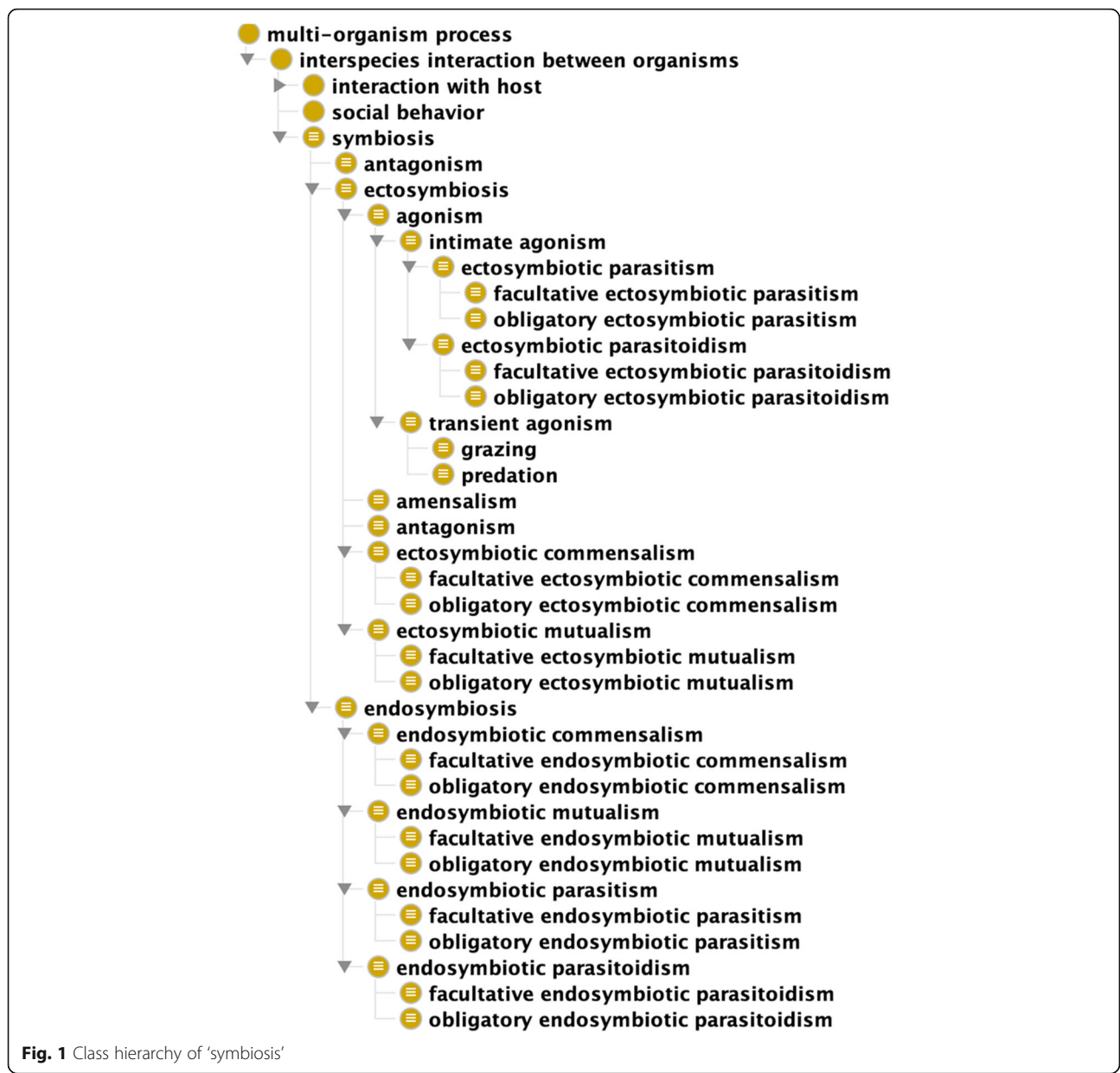
Fig. 1 Class hierarchy of 'symbiosis'

is defined in GO as “Any process in which an organism has a behavioral effect on another organism of the same or different species” (GO:0051705), although our definition of symbiosis would restrict this behavioral interaction to being solely interspecies. Finally, we also specify that the number of organisms of different species participating in a symbiotic interaction does not need to be restricted to two since there are several examples in nature of tripartite interactions (i.e., symbiotic interactions that involve three organisms of separate species. For example, it is now known that many lichens are a composite of organisms from three species that are engaged in a symbiosis with each other).