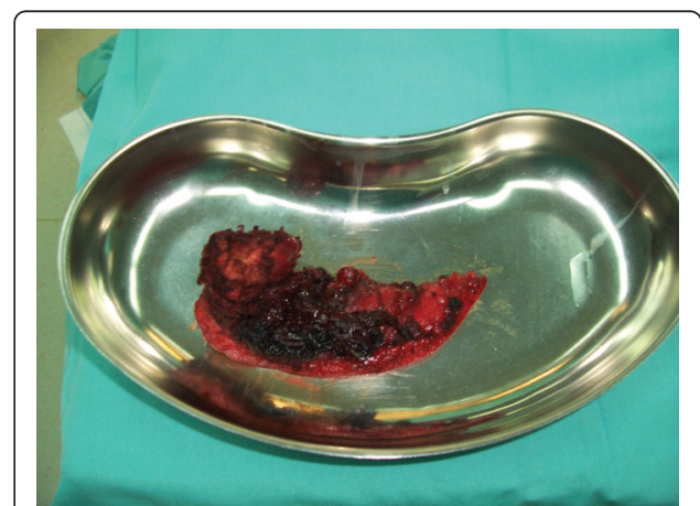
Figure 3 The surgical specimen.