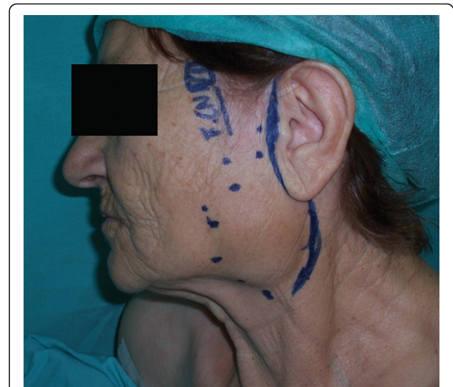
Figure 2 Preoperative planning of the preauricular incision - the circular dotted line represents the tumors margins.

Primary lymphomas of the salivary glands are rare and account for 4.7% of lymphomas at all sites [7]. A non-Hodgkin lymphoma of a salivary gland may appear as a painless, progressively enlarging mass [8-11]. Therefore,