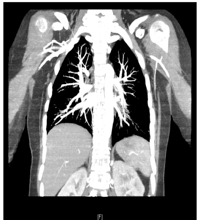
Fig. (2). CT angiography of the chest showing no pulmonary artery aneurysm.

Pulmonary arterial aneurysm (PAA) is the most common type of pulmonary involvement in BD [7]. Since vascular