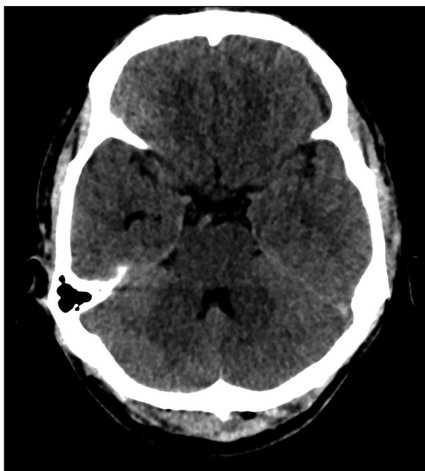
Figure 1: Normal appearance of an axial section of non-contrast computed tomography of the brain

The HINTS consists of head impulse test (HI), assessing nystagmus (N), and the test of skew (TS). The presence of positive HINTS test consists of the normal vestibulo-ocular reflex (normal HI), direction-changing nystagmus (abnormal N) and/or vertical ocular misalignment (abnormal TS) was 100% sensitive and 96% specific for stroke [Figure 3]. [5] A meta-analysis examined the accuracy of positive HINTS in identifying PCS in acute vertigo patients and found it to be 95.5% (95% CI: 92.6–98.4%) sensitive and 71.2% (95% CI: 67.0–75.4%) specific. [6]