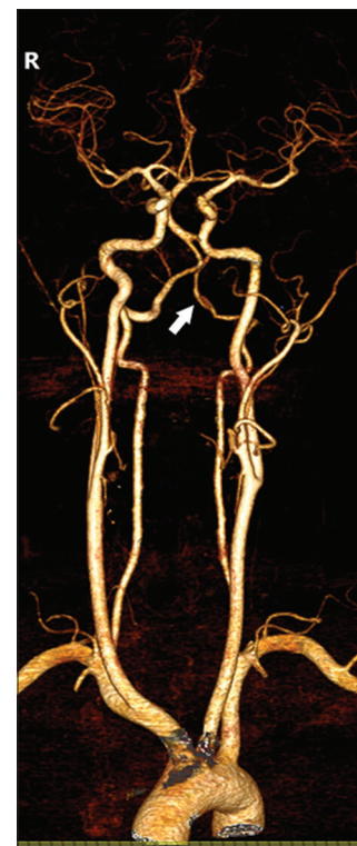
Figure 2: Reconstructed computed tomography with angiography (CTA) revealed dissection of the third and fourth segment of the left vertebral artery (white arrow)

We have presented a case of a young male with isolated vertigo, where the importance of the bedside clinical examination – HINTS was performed, pointing towards a