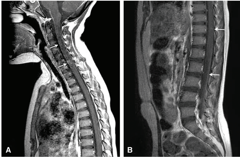
Fig. 2 Gadolinium-enhanced spinal MRI scan showing new disseminations (arrow) after the first tumor resection in the cervical (A) and lumbar (B) regions. MRI: magnetic resonance imaging.

foamy cytoplasm (Fig. 3A). Tumors consisted of small to medium spindle-shaped or multi-ridged cells, cells with multipolar processes, and small cells with a high nuclear-to-cytoplasm ratio (Fig. 3B). These cells were diffusely and densely proliferating. Many small-to medium-sized cells undergoing mitosis were observed, but only a few giant cells undergoing mitosis were observed. Hypervascularization of small vessels with congestion was observed, but no microvascular proliferation was detected. In some areas, geographic necroses were observed.