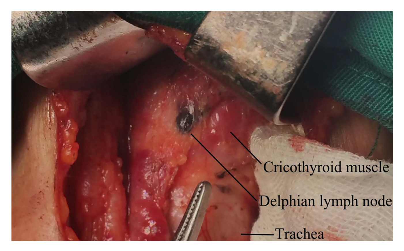
Figure 1: The Delphian lymph node is darkened by nanocarbon.

All 8 previous studies indicated that DLN metastasis is associated with concomitant cervical LNM, but the clinicopathological factors they reported to be associated with DLN metastasis were not consistent. These factors included multifocality [19, 21], autoimmune thyroiditis [25], tumor location [20, 22], lymphovascular invasion