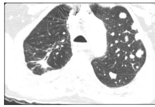
Figure 2: Computed tomography scan after immunotherapy

of breath and left facial pain improved dramatically however vocal cord paralysis persisted. A subsequent positron-emission tomography–CT scan done 8 weeks later showed a mixed response to the therapy.