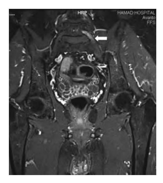
Figure 2. MRI coronal section post gadolinium contrast shows enhancement of the left L5 nerve root (arrow).

Lumbosacral plexitis (LSP) also known as non diabetic lumbosacral radiculoplexus neuropathy (LRPN) is less recognized than its diabetic counterpart. It shares the same clinical and pathological features with diabetic lumbosacral radiculoplexus neuropathy (DLRPN).<sup>2</sup> The one distinguishing feature between the two conditions being the absence of elevated blood sugar in the former. Lumbosacral plexitis (LSP) is an uncommon condition; while the incidence has not been studied it is postulated to be considerably less than one per 100,000 people.<sup>1</sup> It has been recognized relatively recently by Evans and others in the early 1980s<sup>3</sup> which probably reflects it rarity. Thereafter reports in the literature were limited to individual case reports and case series involving a relative small number of patient describing natural