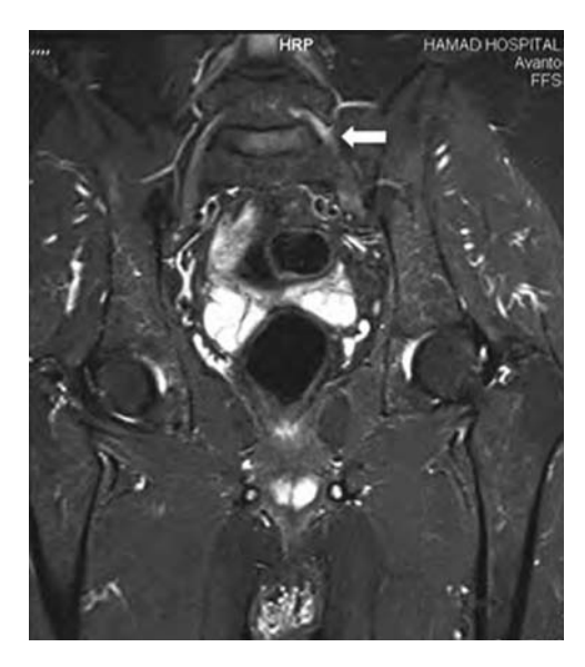
Figure 1. MRI coronal section Short Tau Inversion Recovery (STIR) sequence shows thicker and brighter left L5 nerve root (arrow) as compared with its right counter part.

tendon reflexes were spared and Lase Ique sign was negative. The patient was bed-bound due to severe pain and required high-doses of morphine, diclofenac and pregabalin to achieve pain control. Complete blood count, erythrocyte sedimentation rate (ESR), chemistries, hemoglobin A1c, fasting blood sugar, a 2-hour glucose tolerance and autoimmune screen were normal. Lumbar puncture was declined. Neurophysiologic testing (day 10) showed absent left sural nerve action potential and mild acute signs of denervation in left L5 and S1 myotomes. Lumbosacral spine Magnetic Resonance Imaging (MRI) was normal. Lumbosacral plexus MRI is shown in Figures 1-3. The patient was started on prednisolone 60 mg daily (and gradually tapered) with dramatic reduction in pain and became ambulatory within two days. He was lost to follow up.