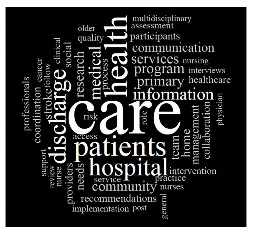
Figure 2 Word cloud of 50 most frequent words.

a contributing factor, <sup>38,51,54,55</sup> resulting in one-way communication, <sup>51</sup> with hospital discharge summaries often not received in time to be relevant to primary care practitioners <sup>53,59</sup> and/or without establishing a shared understanding by determining if the information is according to need and/or understood. <sup>54</sup>