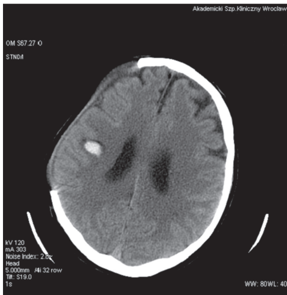
Figure 2. CT examination without contrast administration: haemorrhagic focus on the right side.

sharp instrument (Figure 3A,B). In order to verify this assumption, a close forensic examination of the scalp was conducted in the admission room. The examination revealed a linear incision of approx. 15 mm. Its distance from the margin of the craniectomy hole overlapped with location of the peripheral part of the aforementioned hyperdense structure relative to the hole. This confirmed the connection between the skin incision and the site of intracerebral bleeding. Due to these facts, there arose a strong suspicion that the brain injury was not accidental. As a result, a knife found at the site of the incident, next to the patient, which had not been connected with the patient's state so far, was secured as a potential crime instrument. The size of its blade corresponded strictly to the streak of hyperdense blood. The above presented radiological and clinical data were reported to the police.