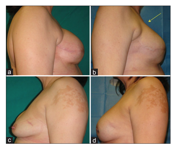
Figure 2: Same patients with outcomes of breast reconstruction: (a) Preoperative situation in lateral right projection with soft tissue defects in the upper pole and in axillary region, (b) postoperative situation in lateral right projection after fat injection in right breast, (c) preoperative situation in lateral left projection, and (d) postoperative situation in lateral left projection after mastoplasty with prostheses