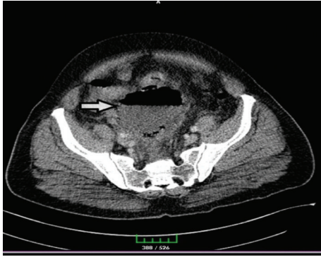
FIGURE 1: CT image showing 98×95 mm abscess with air-fluid levels at the entrance to the pelvic cavity.