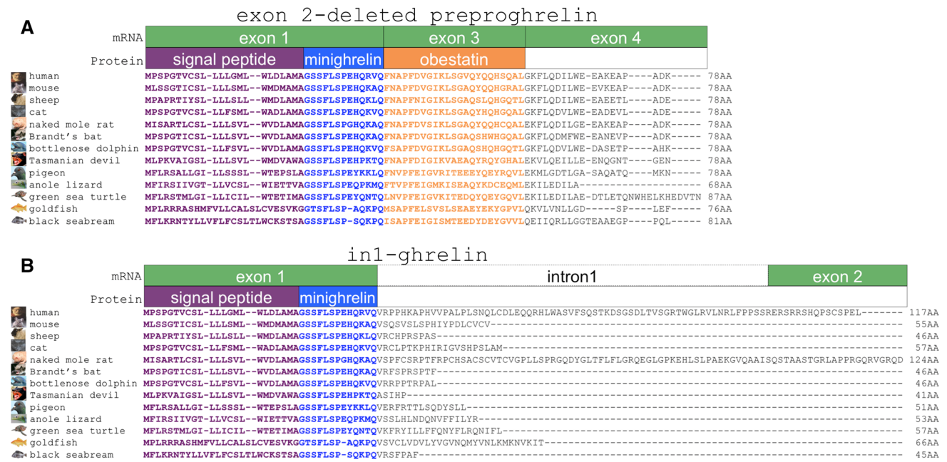
Fig. 1 Overview of exon 2-deleted preproghrelin and in1-ghrelin open reading frames in vertebrates. Bioinformatic prediction of a exon 2-deleted preproghrelin and b in1-ghrelin peptide sequences. Nucleotide databases of diverse species were interrogated for the

preproghrelin gene ( GHRL ) sequences. Canonical coding sequences (mRNA) are shown as green boxes, while the corresponding regions of the signal peptide (purple), minighrelin (blue) and obestatin (orange) are represented as boxes below