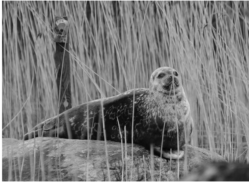
Fig 2. A camera trap and a Saimaa ringed seal at a haul-out site.

https://doi.org/10.1371/journal.pone.0214269.g002