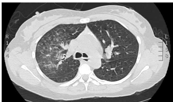
Fig. 2. Chest computed tomography impressive for right upper lobe ground-glass and nodular infiltrates.