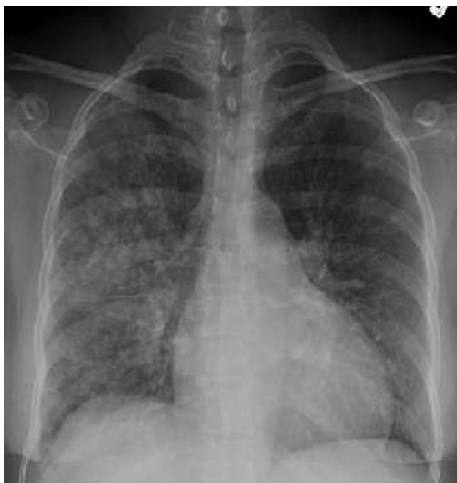
Fig. 1. Chest radiology shows right upper lobe predominant interstitial alveolar pattern.