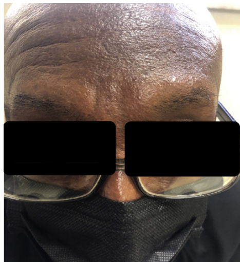
Fig 3. Scleromyxedema with numerous waxy 2 to 3-mm papules on the brows and forehead. Induration of the glabella, an early finding in progression to leonine facies, can also be appreciated.