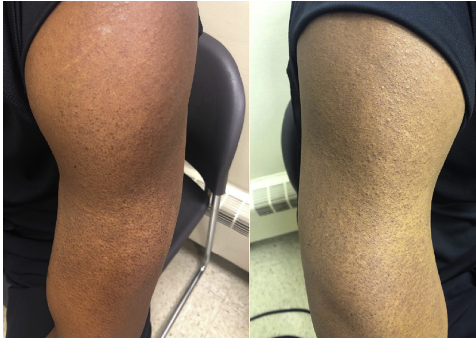
Fig 2. Scleromyxedema presenting as numerous 2 to 4-mm waxy, perfollicular papules on the upper extremities (left, right), face, trunk, and thighs. Some of the papules were arranged in a linear configuration over the chest, a classic finding in scleromyxedema.