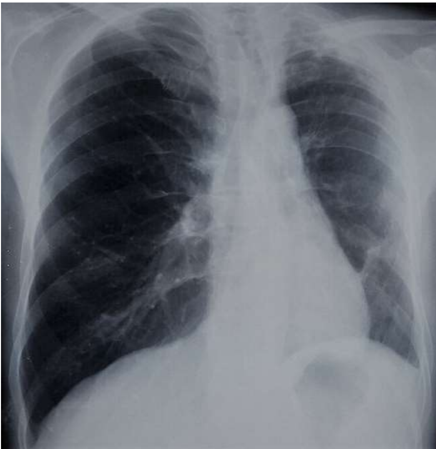
Figure 1: front chest x-ray: retraction of the left pulmonary field, reduction of the left hilum and hyperinflation of the right side