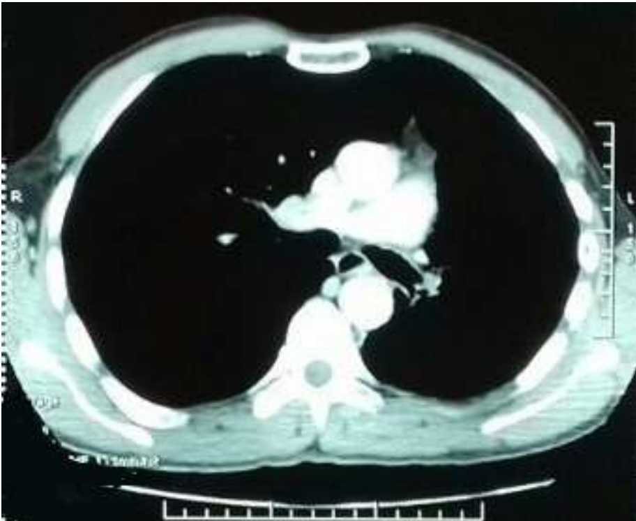
Figure 3: mediastinal section thoracic CT scan: reduction in the diameter of the left pulmonary artery with poorly developed collateral bronchi