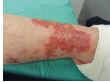
FIGURE 1: Residuum of tissue necrosis, anterior tibial margin, May 2016.

Case reports about WFS focus more on the way the patient's life was saved than on the aftermath. Thus, there is only little