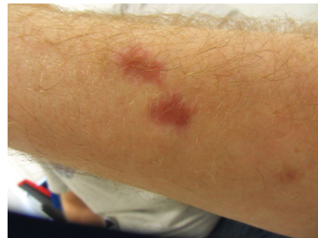
FIGURE 2: Residuum of skin necrosis, lower thigh, May 2016.

published data about the chances of functional adrenocortical remission. The data from our repetitive ACTH-testing over 5 years suggest that a steady regeneration of the zona fasciculata (mainly responsible for cortisol production) after the adrenal trauma caused by WFS is possible.