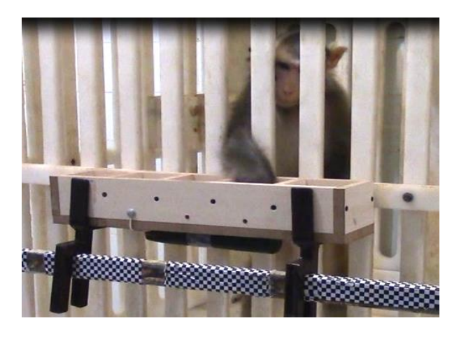
Figure 1. The animal is being tested in a hazard-and-reward condition

One day before the experiments, blood samples (5 ml) were collected from the femoral vein of the monkeys under general anesthesia using ketamine (10 mg/kg, IM). Blood collection was performed between 8–9 AM. The samples were immediately injected into