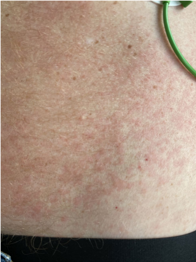
FIGURE 2 A maculopapular rash located on the trunk

photosensitivity disorders consist of actinic prurigo, chronic actinic dermatitis, polymorphous light eruption, and solar urticaria. They are called primary idiopathic photosensitivity disorders due to the fact that they are disorders composed of ultraviolet radiation-induced lesions with an unrecognized cause. Photoaggravated photosensitivity, on the other hand, are called secondary photosensitivity disorders since they arise from increased sensitivity to ultraviolet radiation coming from an underlying disease, such as bullous pemphigoid or systemic lupus erythematosus. Some of the inherited disorders with chromosomal instability or defective DNA repair include Bloom syndrome, trichothiodystrophy, and xeroderma pigmentosum. 1