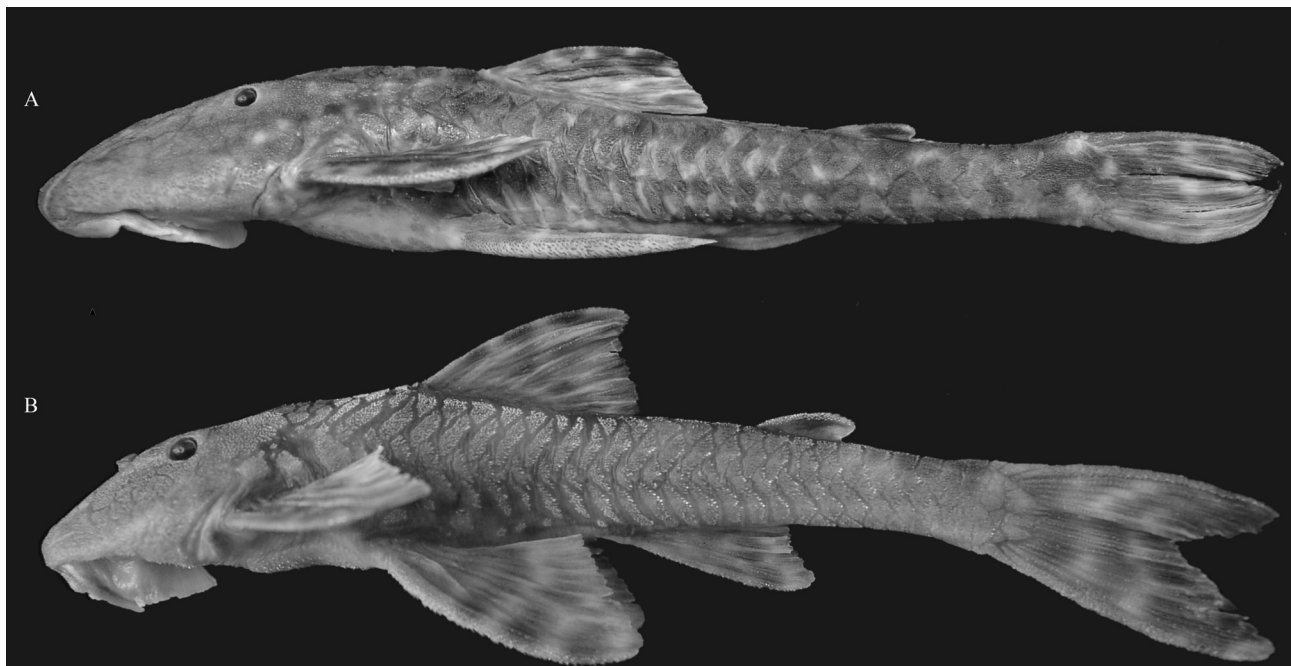
Figure 1 - A) Neoplecostomus sp. 1, CP = 102.2 mm, collected in the Paraitinguinha stream, Salesópolis, SP, NUP6103; B) Neoplecostomus sp. 2, CP = 75.2 mm, collected in São Domingos stream, Muzambinho, MG, NUP 6102.

Samples of liver and white muscle were homogenized with a plastic pestle in polypropylene tubes (1.5 mL) containing 100 µL of 0.02 M Tris-HCl, pH 7.5. To the liver samples 100 µL of carbon tetrachloride (CCl 4 ) was added