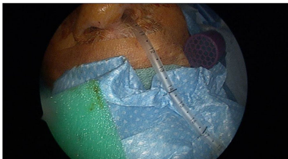
Fig. 1 Intra-operative photo demonstrating nasopharyngeal suction catheter stapled to drape and Buffalo filter suction tubing secured to left cheek

Barrier options A recent publication describes the use of a ventilated type mask and laparoscopy trocar as a method to reduce aerosol spread during skull base procedures [122]. Another study proposed the use of a plastic drape suspended over the patient's head with a smoke evacuator suction placed inside the chamber to create a negative pressure environment in endonasal surgery [123]. Droplets were identified at the tip of the smoke evacuator in cases with prolonged high-speed drilling, leading the authors to hypothesize that this apparatus may effectively capture fluid in the form of droplets or aerosols. Utilization of these types of methods may complicate the facility of introduction and freedom of movement of surgical instruments into the operative field.