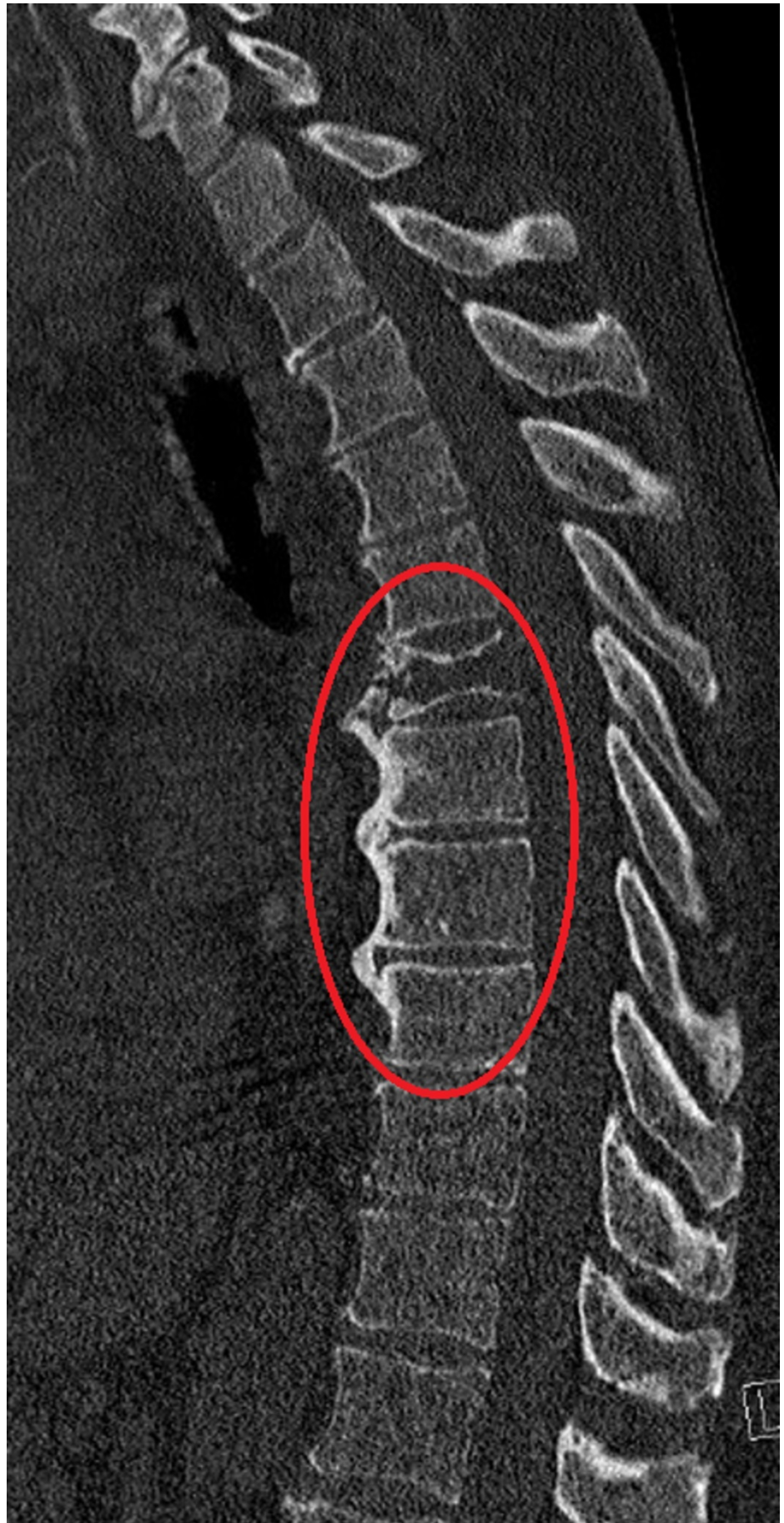
FIGURE 1: Computed tomography scan without contrast of