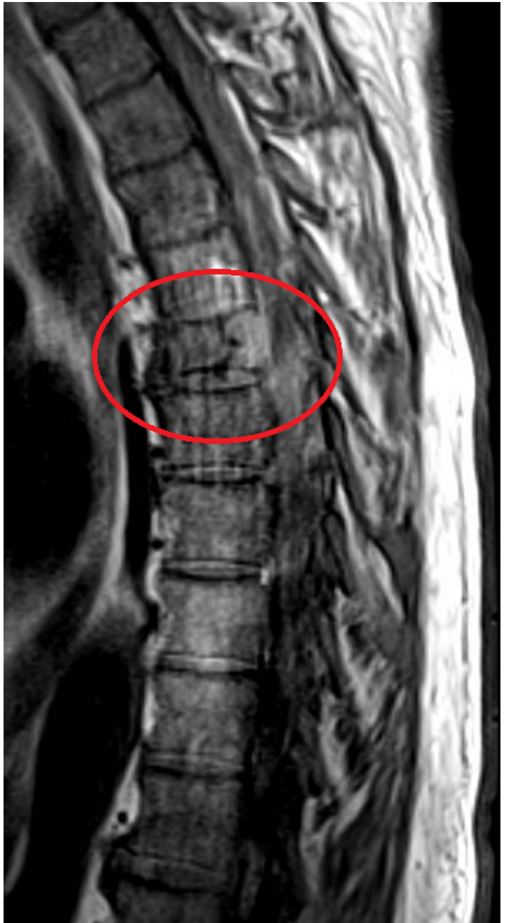
FIGURE 2: Magnetic resonance imaging of the thoracic spine