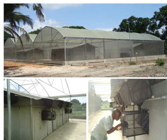
Figure 1 Semi-field system and experimental hut at the Ifakara health Institute, Bagamoyo, Tanzania.

Disease-free and blood-naïve female Anopheles gambiae s.s. (Ifakara strain), aged 2-5 days old were used in this study. These mosquitoes were reared under natural photoperiod at 27°C and 80% humidity, in Kingani insectary laboratory