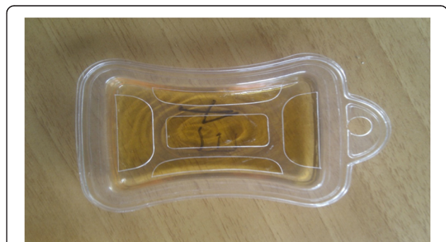
Figure 2 Linalool 73% agar gel emanator.

from separate SFS compartments were assigned the same treatment consisting of two 73% d-linalool emanators hanging approximately 1.5 m high above the ground and 1 m from each corner, these emanators were fixed throughout experimental night. The other two huts were randomly allocated two transfluthrin 0.03% mosquito coils lit on plates placed in two mid points of the hut and one hut was left with no treatment. In both experimental huts, two participants slept on a mattress at the center of the hut with.