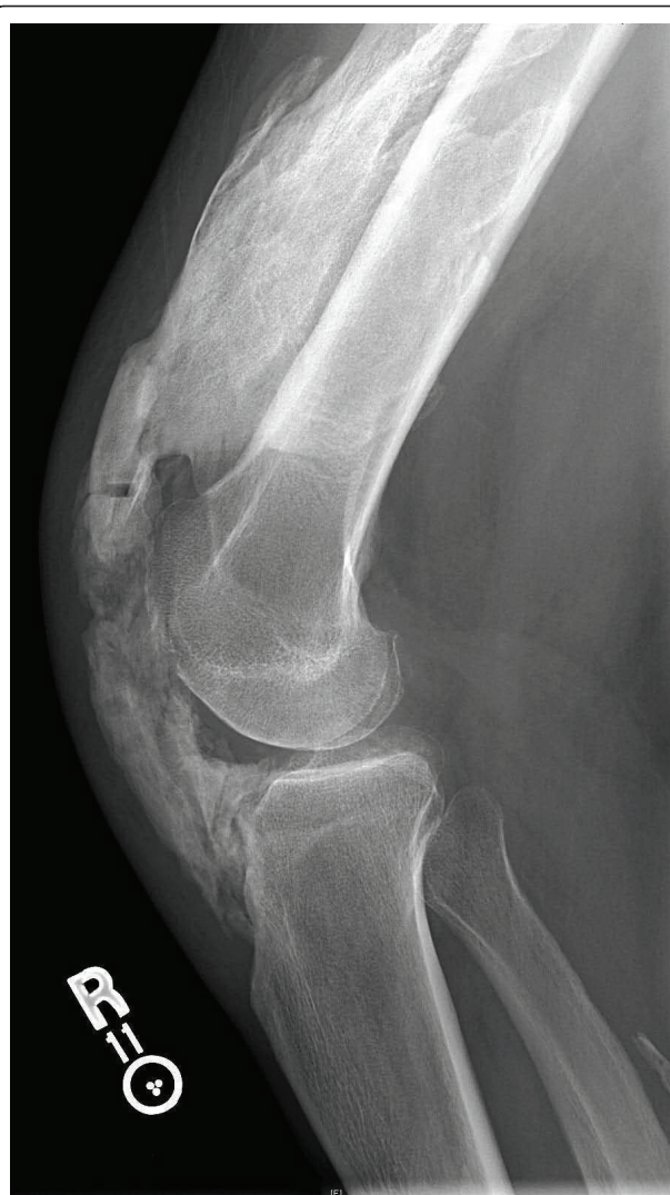
Figure 2 Lateral X-ray three months after patellar tendon repair showing marked progression of HO.

45 degrees. Despite the deteriorating range of motion, plantar and dorsiflexion remained intact. Sensation was intact and there was brisk capillary refill.