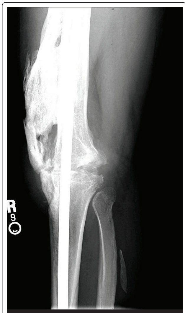
Figure 3 Lateral X-ray of the patient's right knee after surgery to accomplish arthrodesis.