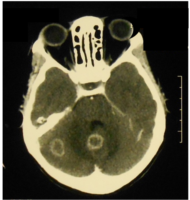
Figure 1 CT scan showing cerebellar ring-enhancing lesion in a child with tuberculosis.

CT scanning, if available, can be useful in specific circumstances, including where the clinical diagnosis is in doubt, or there is a suspicion of developing hydrocephalus. The typical findings of CNS TB include diffuse basal leptomeningeal enhancement on contrast-enhanced CT, hydrocephalus, supratentorial and brainstem infarction, and tubercular granulomas. 11–13 Precontrast hyperdensity of the basal cisterns has been reported to also be a specific feature of TBM in children. 14 Large ventricles, from hydrocephalus and/or cerebral atrophy occur in up to 70% of children with TBM who have CT scans. 12 Tubercular granulomas with caseation have central heterogeneous enhancement and a ring-enhancing capsule (figure 1); once a tubercular granuloma proceeds to liquefaction, the CT appearance is that of