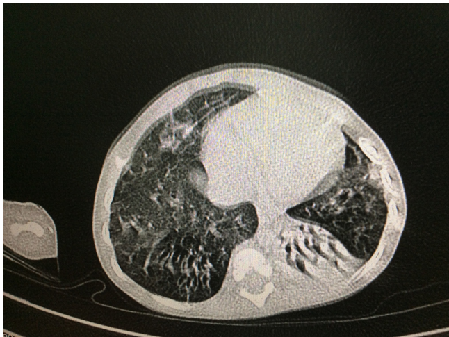
Figure 3 CT chest of a child with chronic cystic lung disease and bronchiectasis due to tuberculosis.

child. They should also be advised that it takes time to determine the prognosis and outcome, that everyone in the ward will do their best to optimise the outcome and that they—the parents—have a large role in helping the child improve, by adhering to medicines and providing supportive care, love and encouragement. Parents should be informed that the hospital treatment is long; 2 to 9 months of hospitalisation depending on the rate of recovery. Such information puts parents and staff in a much better position to accept positive or negative outcomes. It is important not to raise unrealistic expectations, but also important not to take away hope, which is essential for parent's mental health and the recovery of the child.