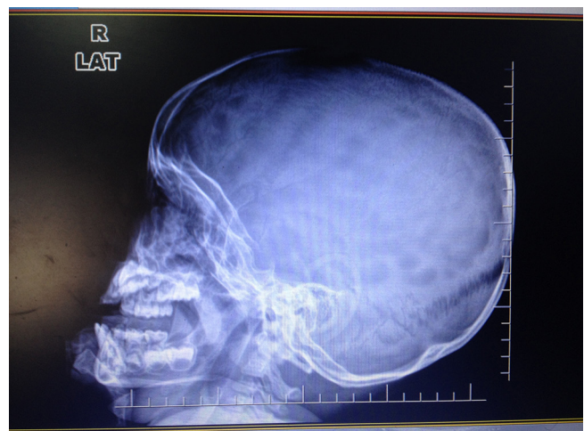
Figure 2 Lateral skull X-ray of a child with tuberculosis with raised intracranial pressure.

Sometimes, difficult treatment decisions arise when children are slow to improve. If there has been no objective improvement