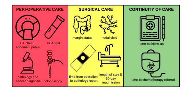
Figure 2. The three moments of cancer care.

ment, we identified complete CT staging (chest, abdomen, and pelvis), CEA levels within 30-days of the operation, pre-operative cancer diagnosis, pre-operative pathology status, and pre-operative colonoscopy as factors representing excellent care. For the surgical quality moment, we identified margin status, nodal yield, and time from operation to pathology report, as factors representing excellent care. At our institution, surgical specimens from elective cancer cases are automatically flagged for urgent pathological analysis to facilitate adjuvant therapy planning, if needed. We hypothesized that EM cases would have a greater delay from surgery to pathology result because this systematic approach is lost and the responsibility to mark a specimen as "urgent" falls to the individual surgeon. This delay would also, theoretically have had implications for timely referral for, and receipt of adjuvant therapy.