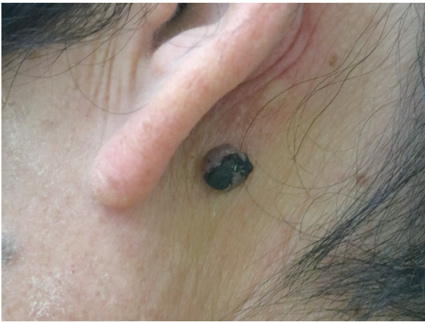
Fig. 1. Photograph showing a solitary, asymptomatic, 1.0x1.0 cm sized, brownish, protruding, soft nodule with central dark crust.