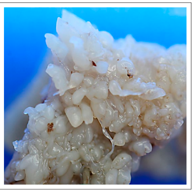
Figure 2 Formalin-fixed perimetrial surface of uterine body revealing diffuse-to-coalescing polypoid lesions

Following lavage, uterine replacement was unsuccessful. The following morning the cat was anaes thetised for manual prolapse reduction and ovariohysterectomy. Attempts at reducing the uterus were again unsuccessful so an internal ovariectomy and external hysterectomy were performed. A ventral midline coeliotomy incision was made. The ovarian pedicles were transfixed and ligated prior to transection and before manipulating the uterine body further. The everted uterus was circumferentially ligated distal to the cervix (approximately 5 cm away from the vulva) and transected. The remaining uterus was returned to the abdominal cavity. From within the abdominal cavity, the uterine body was double ligated proximal to the previously placed ligature. Excess uterine stump was removed. During surgery, the serosa of uterine body was noted to be diffusely thickened by multiple-to-coalescing