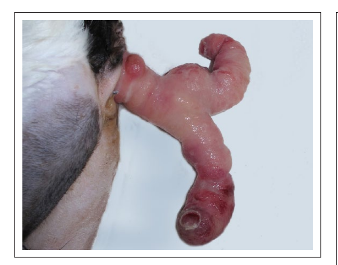
Figure 1 Prolapsed and everted uterus following lavage which revealed swollen, hyperaemic and viable tissue

4.64 \times 10^{12} /l [RI 5–10 × 10<sup>12</sup>/l], reticulocytes 375.84 × 10 /l [RI 0-40 \times 10<sup>6</sup>/l]) and a neutrophilic leukocytosis with mild toxic changes (leukocytes 37.72 × 109/l [RI 5.5-19.5 \times 10^9/1 ]; neutrophils 25.3 \times 10^9/1 [RI 2.5-12.5 \times 10^9/1 ]; neutrophils 25.3 \times 10^9/1 109/1]). Blood biochemistry showed a mild hyperkalaemia (6.0 mmol/l [RI 3.7–5.8 mmol/l]) and mild hypoglycaemia (66 mg/dl [RI 70-150 mg/dl]). This was attributed to a grossly lipaemic sample. From these samples oestrogen plasma concentrations were retrospectively evaluated at 25.7 pg/ml (RI 15-40 pg/ml). There was insufficient sample to evaluate progesterone concentrations. Intravenous crystalloid fluid solution (Plasmalyte; Travenol Laboratories) was administered to correct an estimated 8% dehydration deficit and maintenance requirement over 12 h. Antibiotic therapy consisting of intravenous cefazolin sodium (Cefazolin for Injection; West-ward Pharmaceutical) at a dose rate of 22 mg/kg IV q8h was also administered.