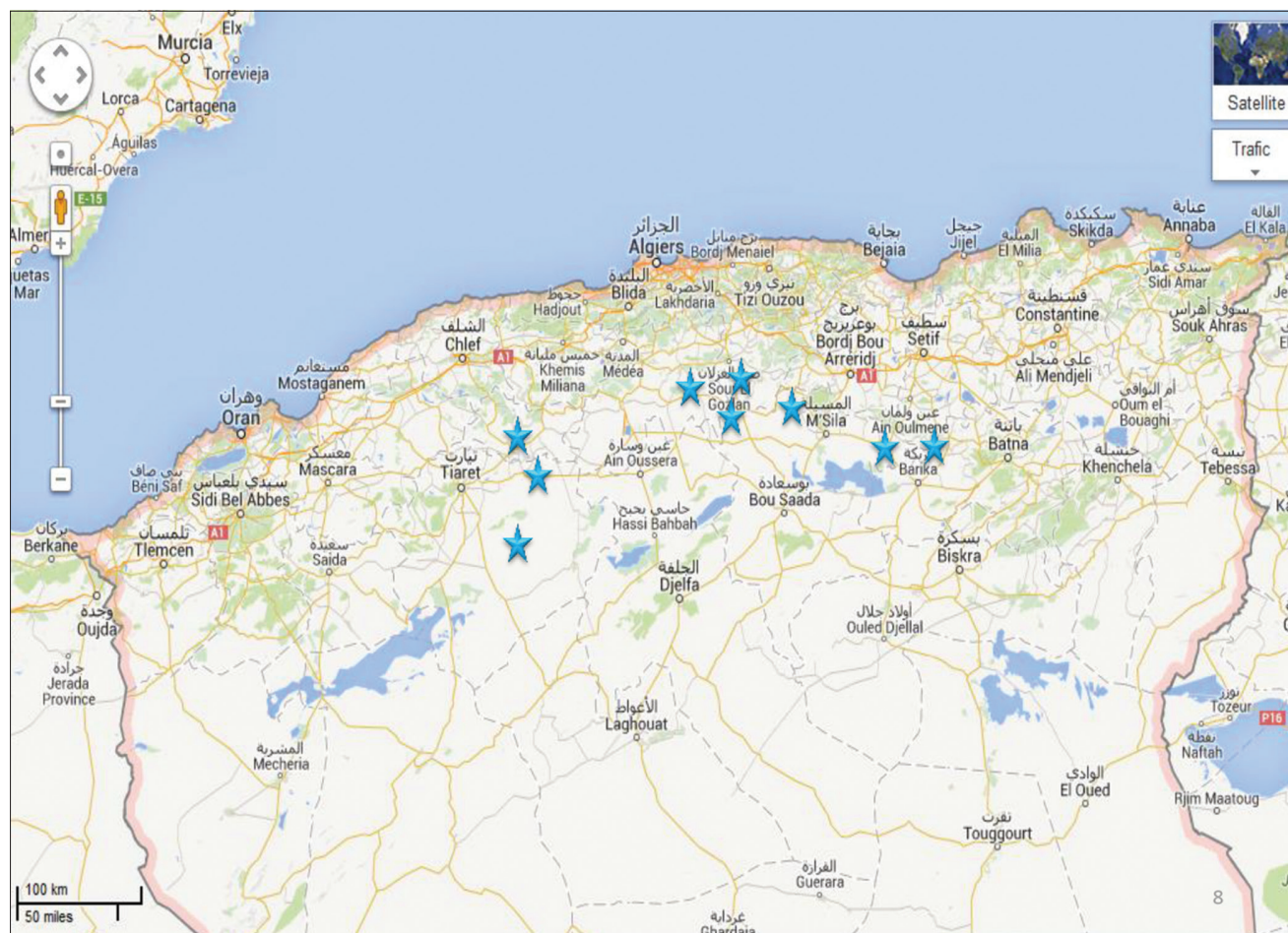
Figure-1: Map of the 48 laying hen farms covered by the serological study of laryngotracheitis in Algeria..

sets of sampling, and the CV and ELISA baselines were all considered in interpreting the ELISA results. According to the baselines of IDvet, the expected average antibody titers after the first application of a live attenuated CEO vaccine vary from 1000 to 3000 within 6-10 weeks after vaccination, with 80-100% seropositivity; and after two vaccinations, the titers vary from 1000 to 4000. The CV must be between 40% and 60% to be considered a good vaccination. Titers below 1000 indicate a poor or no vaccination intake or an immuno-depressive disease, and more than 3000 for a single live vaccine, and 4000 for two live vaccines with a tight CV (<40%) indicate a viral passage.