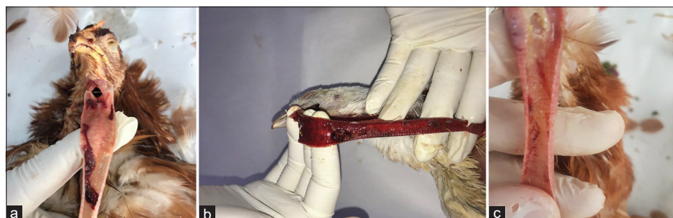
Figure-2: Gross pathologic tracheal lesions associated with various stages of laryngotracheitis infection in layer hens (a) hemorrhage in trachea, (b) fibrinohemorrhagic tracheitis, (c) caseous plug in trachea.

CI=Confidence intervals, ILT=Infectious laryngotracheitis